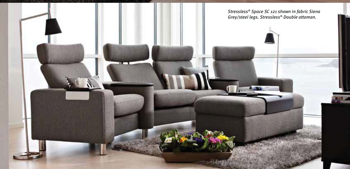
Stressless® Space SC 121 shown in fabric Siena Grey/steel legs. Stressless® Double ottoman.