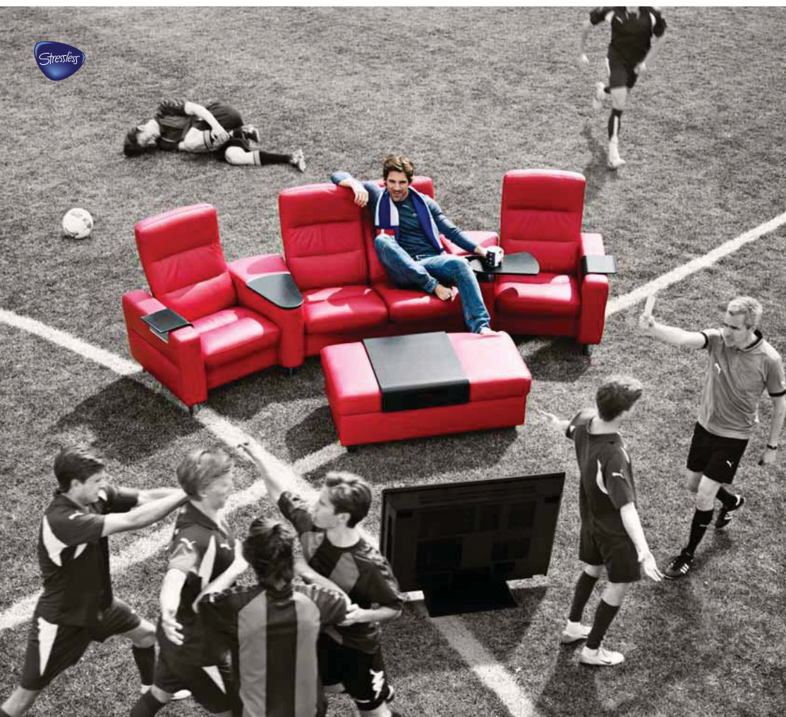
Stressless® Wave SC 121 shown in Paloma Chilli Red/Round wooden legs, Stressless® Easy armrest table, Stressless® Double ottoman.